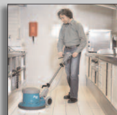
Machine in action