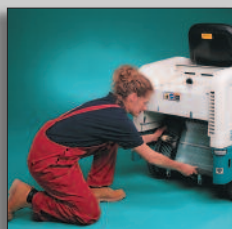
No-tool filter change