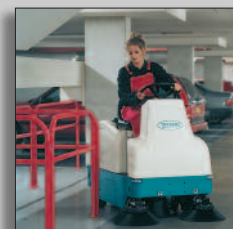
Machine in action