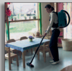
Machine in action