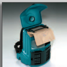
Easy to change filter bag